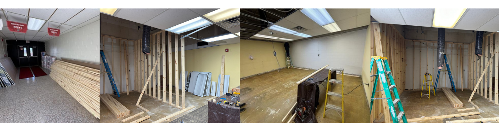
HOW ITS GOING...