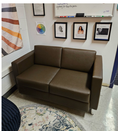
The RAHS Social Work office at RAHS-Scarlett Middle School has a new couch!